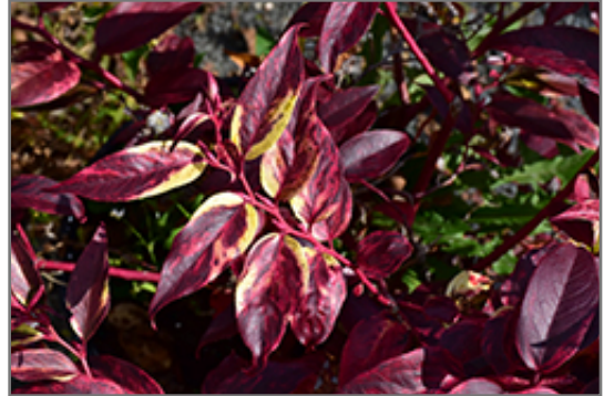
Rainbow Fetterbush in fall

Rainbow Fetterbush makes a fine choice for the outdoor landscape, but it is also well-suited for use in outdoor pots and containers. Because of its height, it is often used as a 'thriller' in the 'spiller-thriller-filler' container combination; plant it near the center of the pot, surrounded by smaller plants and those that spill over the edges. It is even sizeable enough that it can be grown alone in a suitable container. Note that when grown in a container, it may not perform exactly as indicated on the tag - this is to be expected. Also note that when growing plants in outdoor containers and baskets, they may require more frequent waterings than they would in the yard or garden.