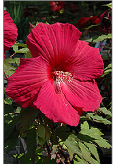
Sultry Kiss Hibiscus flowers

This bold garden perennial features showy ruffled, large hot pink flowers that are produced at the nodes all up the stems; attractive, glossy, dark-green/bronze leaves; ideal for the mixed garden border or in mass; do not allow to dry to wilting point