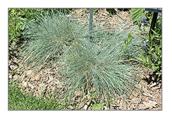
Superba Tufted Fescue