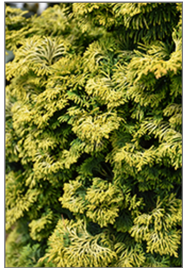
Dwarf Golden Hinoki Falsecypress foliage