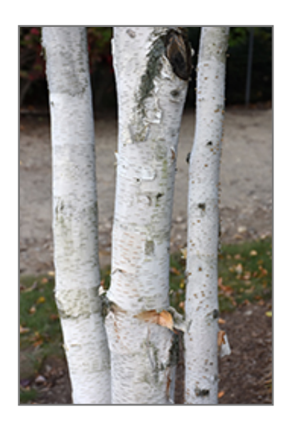
Whitebark Himalayan Birch bark