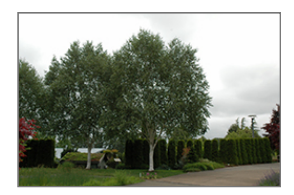
Whitebark Himalayan Birch

Whitebark Himalayan Birch is recommended for the following landscape applications;