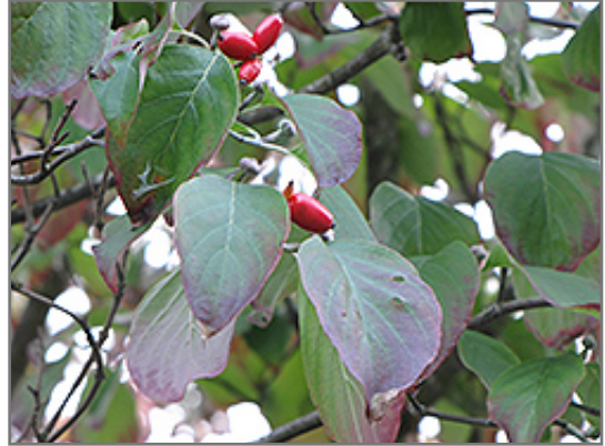
Cherokee Chief Flowering Dogwood fruit

This tree does best in full sun to partial shade. You may want to keep it away from hot, dry locations that receive direct afternoon sun or which get reflected sunlight, such as against the south side of a white wall. It requires an evenly moist well-drained soil for optimal growth, but will die in standing water. It is very fussy about its soil conditions and must have rich, acidic soils to ensure success, and is subject to chlorosis (yellowing) of the foliage in alkaline soils. It is quite intolerant of urban pollution, therefore inner city or urban streetside plantings are best avoided, and will benefit from being planted in a relatively sheltered location. Consider applying a thick mulch around the root zone in winter to protect it in exposed locations or colder microclimates. This is a selection of a native North American species.