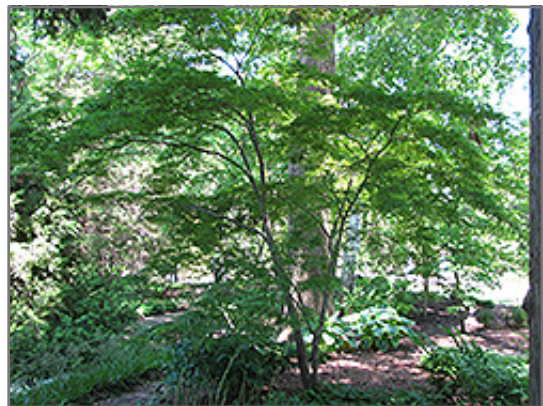
Linearilobum Japanese Maple