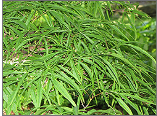
Linearilobum Japanese Maple foliage

Linearilobum Japanese Maple is recommended for the following landscape applications;