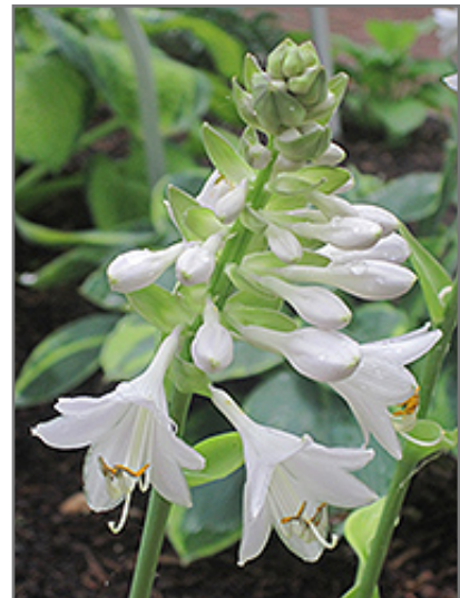
King Tut Hosta flowers