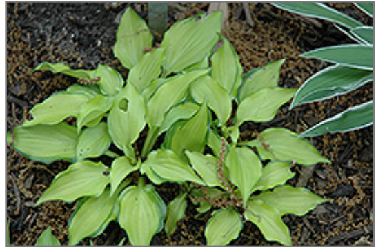
Cracker Crumbs Hosta

Cracker Crumbs Hosta is recommended for the following landscape applications;