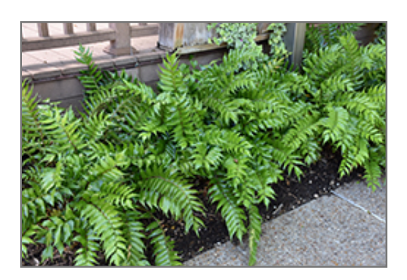
Japanese Holly Fern

Japanese Holly Fern is an herbaceous evergreen fern with a shapely form and gracefully arching fronds. Its relatively fine texture sets it apart from other garden plants with less refined foliage.