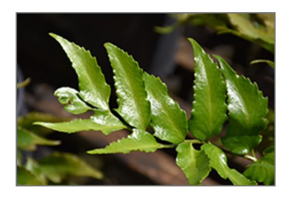
Japanese Holly Fern foliage