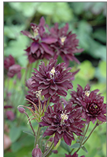
Clementine Dark Purple Columbine flowers