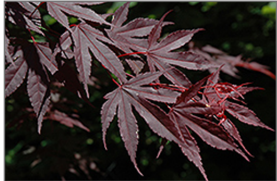
Crimson Prince Japanese Maple foliage