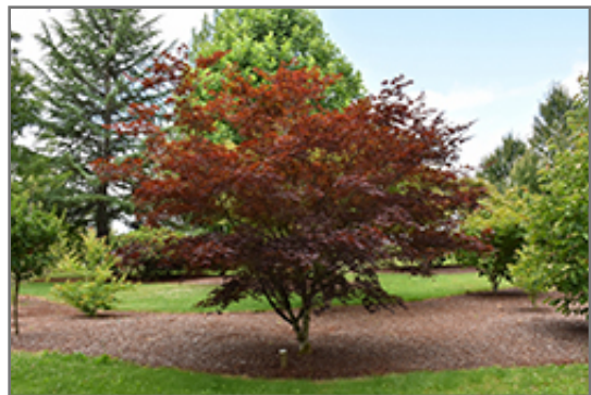
Crimson Prince Japanese Maple