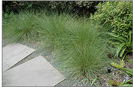
Hairawn Muhly

Hairawn Muhly is recommended for the following landscape applications;