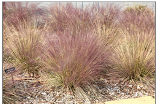
Hairawn Muhly in fall