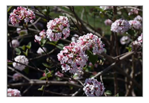
Koreanspice Viburnum flowers