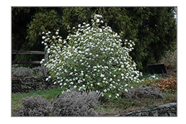
Koreanspice Viburnum in bloom

This is a relatively low maintenance shrub, and should only be pruned after flowering to avoid removing any of the current season's flowers. It is a good choice for attracting birds to your yard, but is not particularly attractive to deer who tend to leave it alone in favor of tastier treats. It has no significant negative characteristics.