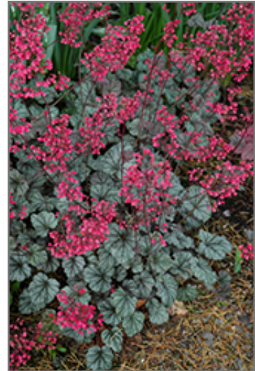
Rave On Coral Bells in bloom