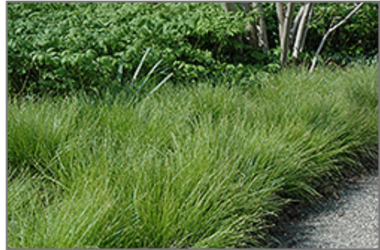
Eastern Star Sedge