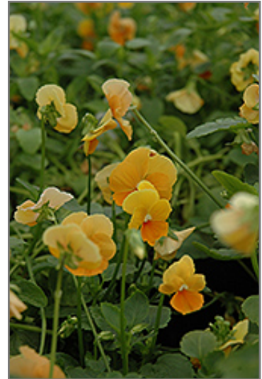
Chantreyland Pansy flowers