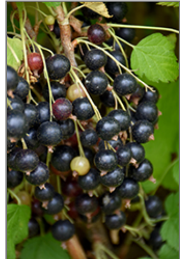
Ben Nevis Black Currant fruit

Ben Nevis Black Currant has rich green deciduous foliage on a plant with a round habit of growth. The lobed leaves turn yellow in fall. It features an abundance of magnificent black berries from mid to late summer.