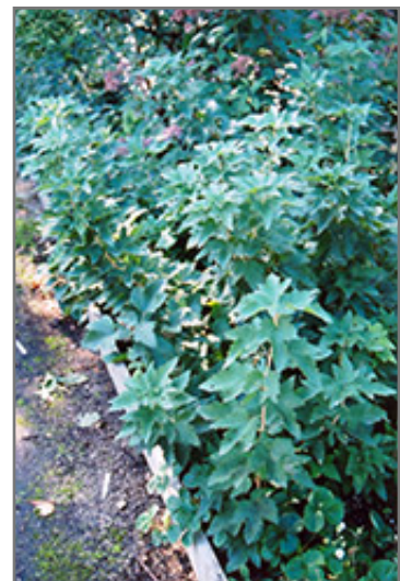
Ben Nevis Black Currant