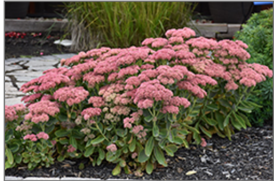
Autumn Fire Stonecrop in bloom

Autumn Fire Stonecrop is recommended for the following landscape applications;