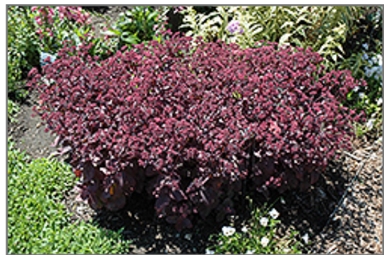
Xenox Stonecrop in bloom