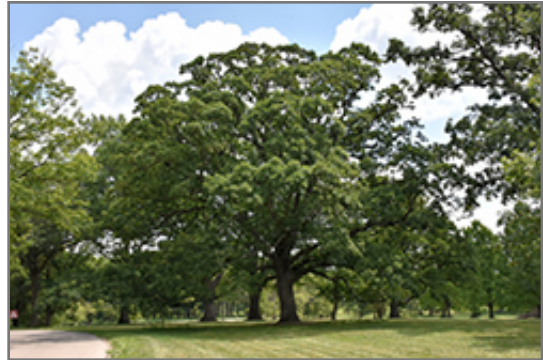
White Oak

White Oak is recommended for the following landscape applications;