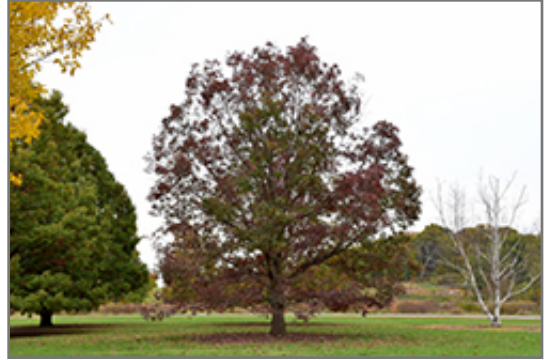
White Oak in fall

This tree should only be grown in full sunlight. It is very adaptable to both dry and moist locations, and should do just fine under average home landscape conditions. It is not particular as to soil type, but has a definite preference for acidic soils. It is highly tolerant of urban pollution and will even thrive in inner city environments. This species is native to parts of North America.