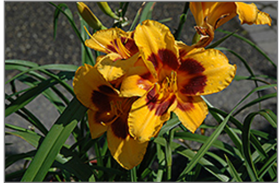
Black Eyed Susan Daylily flowers