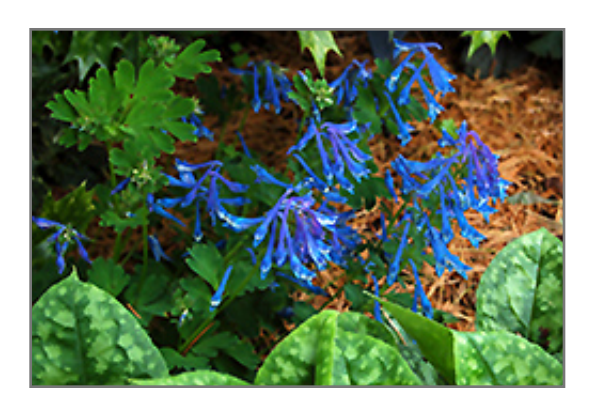
Blue Corydalis flowers