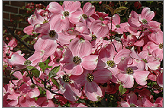
Cherokee Brave Flowering Dogwood flowers

This is a relatively low maintenance tree, and should only be pruned after flowering to avoid removing any of the current season's flowers. It is a good choice for attracting birds to your yard. Gardeners should be aware of the following characteristic(s) that may warrant special consideration;