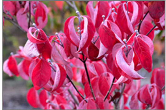
Cherokee Brave Flowering Dogwood in fall

This tree does best in full sun to partial shade. You may want to keep it away from hot, dry locations that receive direct afternoon sun or which get reflected sunlight, such as against the south side of a white wall. It requires an evenly moist well-drained soil for optimal growth, but will die in standing water. It is very fussy about its soil conditions and must have rich, acidic soils to ensure success, and is subject to chlorosis (yellowing) of the foliage in alkaline soils. It is quite intolerant of urban pollution, therefore inner city or urban streetside plantings are best avoided, and will benefit from being planted in a relatively sheltered location. Consider applying a thick mulch around the root zone in winter to protect it in exposed locations or colder microclimates. This is a selection of a native North American species.