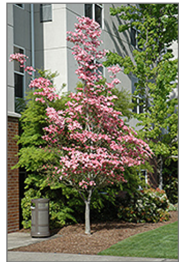
Cherokee Brave Flowering Dogwood in bloom