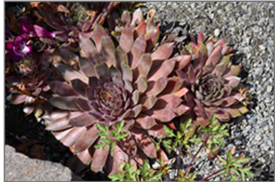
Kalinda Hens And Chicks

Kalinda Hens And Chicks is recommended for the following landscape applications;