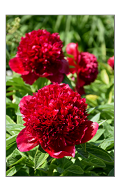
Red Charm Peony flowers

Red Charm Peony will grow to be about 30 inches tall at maturity, with a spread of 3 feet. When grown in masses or used as a bedding plant, individual plants should be spaced approximately 30 inches apart. The flower stalks can be weak and so it may require staking in exposed sites or excessively rich soils. It grows at a slow rate, and under ideal conditions can be expected to live for approximately 20 years. As an herbaceous perennial, this plant will usually die back to the crown each winter, and will regrow from the base each spring. Be careful not to disturb the crown in late winter when it may not be readily seen!