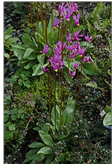
Shooting Star in bloom