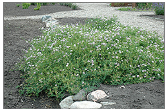
Crown Vetch in bloom