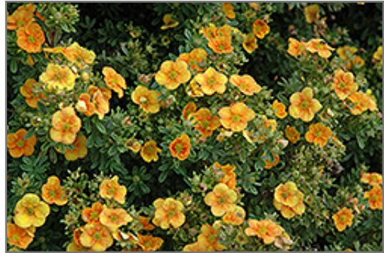
Mango Tango Potentilla flowers