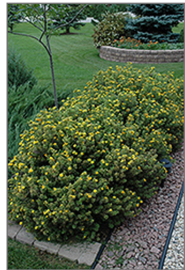
Mango Tango Potentilla in bloom