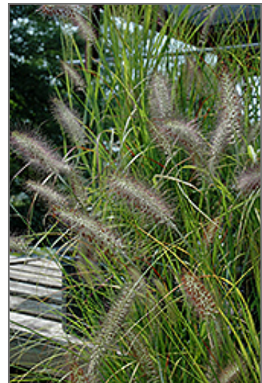
Cassian Dwarf Fountain Grass flowers