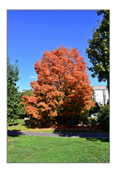
Bonfire Sugar Maple in fall