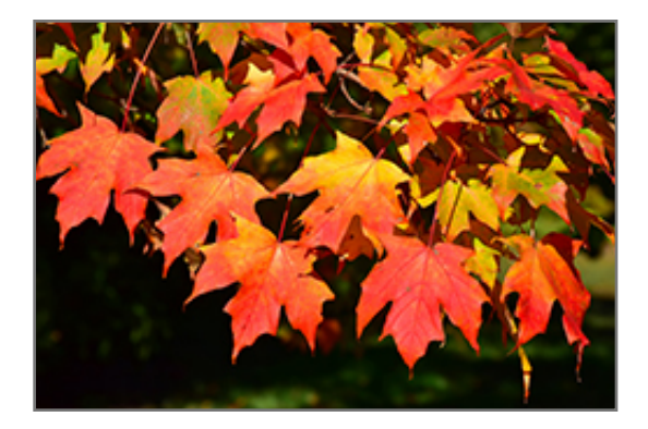
Bonfire Sugar Maple in fall