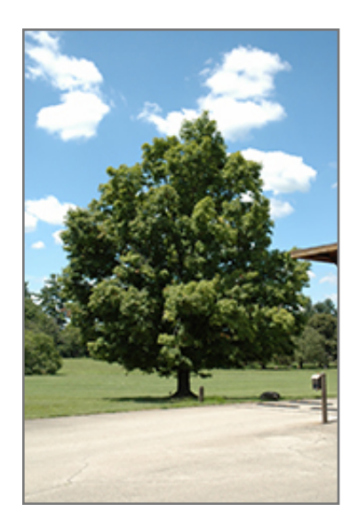
Bonfire Sugar Maple

This tree should only be grown in full sunlight. It prefers to grow in average to moist conditions, and shouldn't be allowed to dry out. It is not particular as to soil pH, but grows best in rich soils. It is somewhat tolerant of urban pollution. This is a selection of a native North American species.