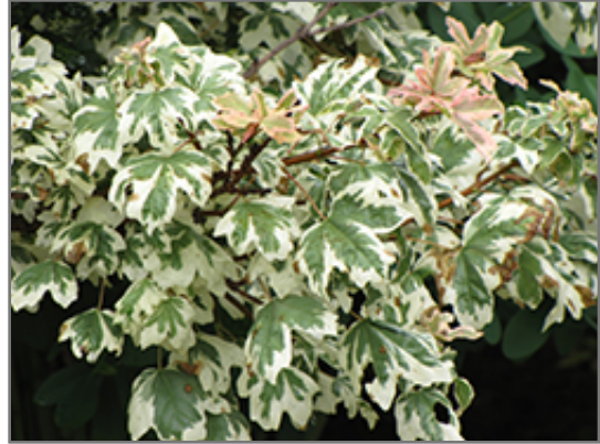
Carnival Hedge Maple foliage