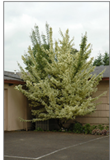
Carnival Hedge Maple