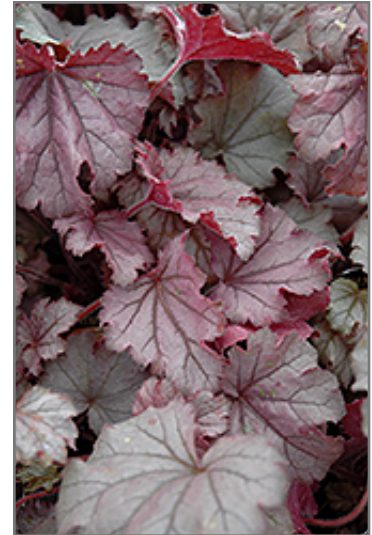
Little Cuties Sugar Berry Coral Bells foliage

Little Cuties Sugar Berry Coral Bells is recommended for the following landscape applications;