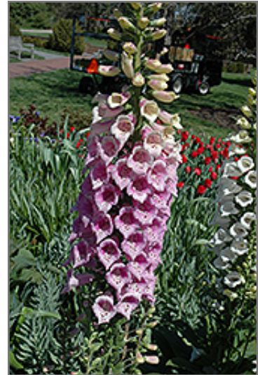
Excelsior Pink Foxglove flowers