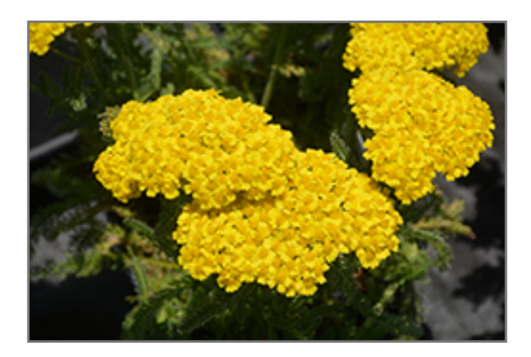
Desert Eve Yellow Yarrow flowers