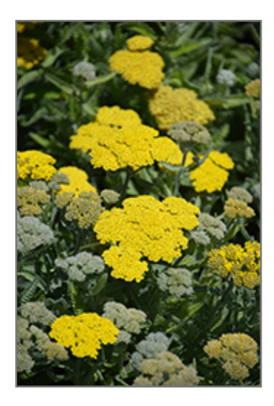
Desert Eve Yellow Yarrow flowers