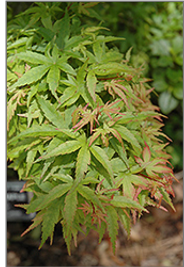
Sharp's Pygmy Japanese Maple foliage