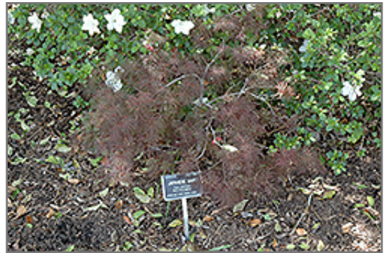
Red Feathers Japanese Maple