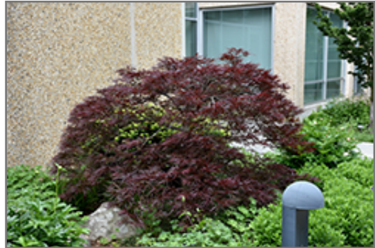
Red Dragon Japanese Maple

Red Dragon Japanese Maple is recommended for the following landscape applications;