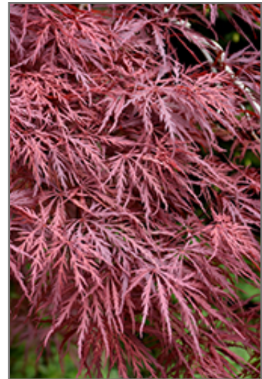
Red Dragon Japanese Maple foliage