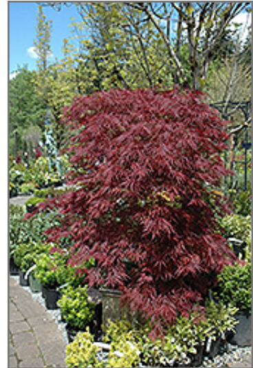
Red Dragon Japanese Maple

Red Dragon Japanese Maple is a fine choice for the yard, but it is also a good selection for planting in outdoor pots and containers. Because of its height, it is often used as a 'thriller' in the 'spiller-thriller-filler' container combination; plant it near the center of the pot, surrounded by smaller plants and those that spill over the edges. It is even sizeable enough that it can be grown alone in a suitable container. Note that when grown in a container, it may not perform exactly as indicated on the tag - this is to be expected. Also note that when growing plants in outdoor containers and baskets, they may require more frequent waterings than they would in the yard or garden.