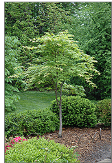
Osakazuki Japanese Maple