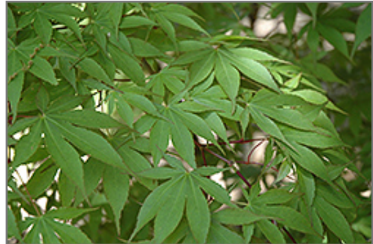
Osakazuki Japanese Maple foliage

Osakazuki Japanese Maple is recommended for the following landscape applications;