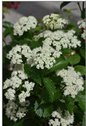
Blue Muffin Viburnum flowers