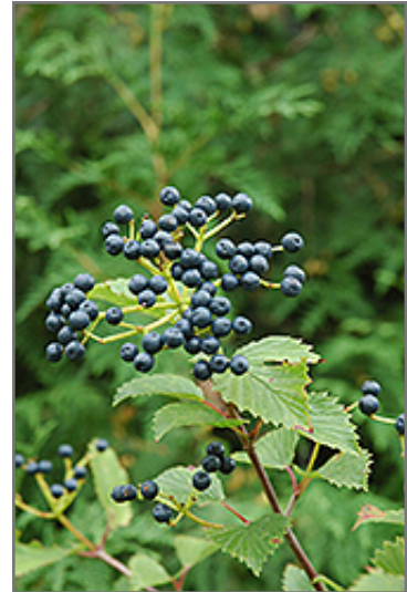
Blue Muffin Viburnum fruit