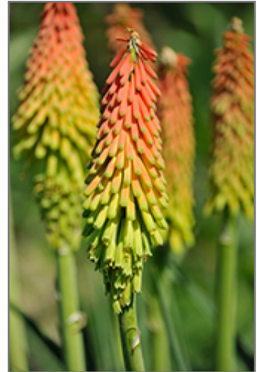
Fire Dance Torchlily flowers