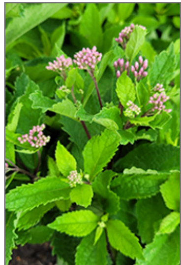
Phantom Joe Pye Weed flower buds