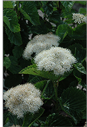
Blue Blaze Viburnum flowers

Blue Blaze Viburnum is recommended for the following landscape applications;