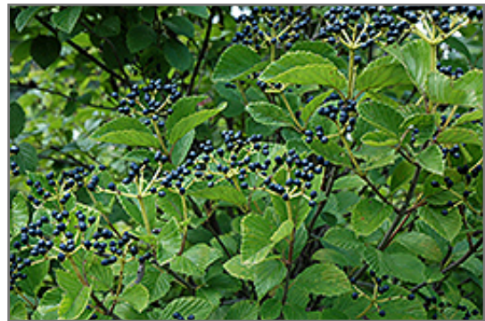
Blue Blaze Viburnum fruit