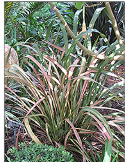
Jester New Zealand Flax