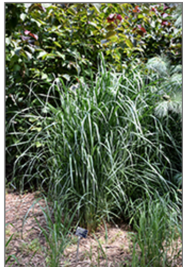
Thundercloud Switch Grass