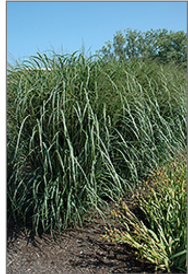
Thundercloud Switch Grass