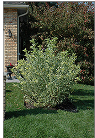
Madonna Elder