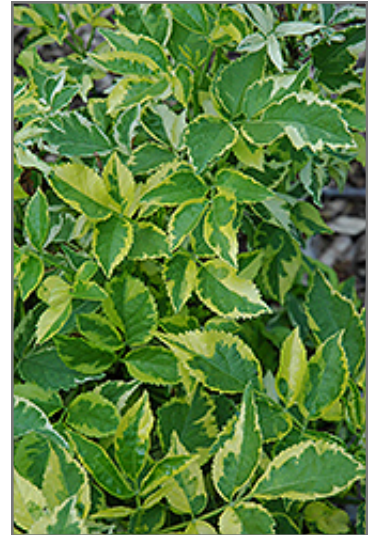
Madonna Elder foliage

Madonna Elder is recommended for the following landscape applications;