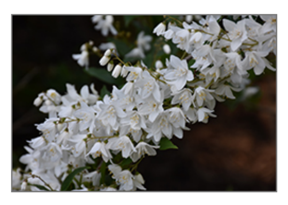
Slender Deutzia flowers

4000 Eglinton Avenue West Etobicoke, Ontario