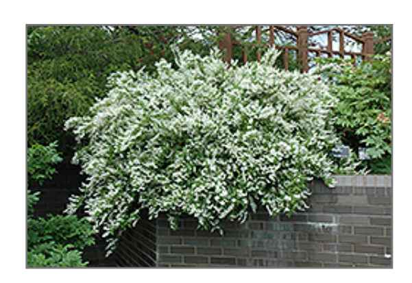
Slender Deutzia in bloom

Slender Deutzia will grow to be about 3 feet tall at maturity, with a spread of 4 feet. It has a low canopy. It grows at a slow rate, and under ideal conditions can be expected to live for approximately 20 years.