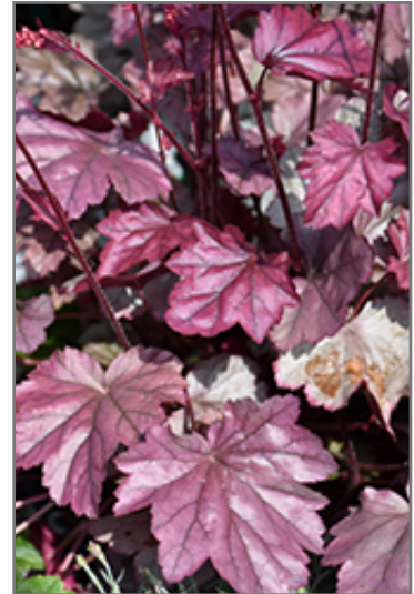
Stainless Steel Coral Bells foliage