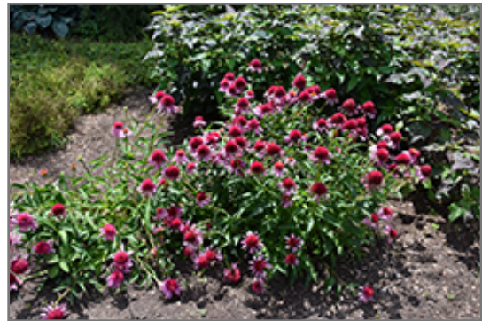
Double Scoop Bubble Gum Coneflower in bloom