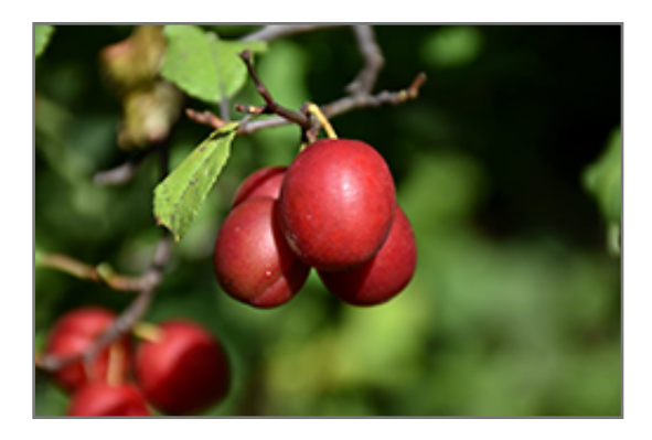
Toka Plum fruit

Toka Plum is blanketed in stunning clusters of fragrant white flowers along the branches in early spring before the leaves. It has forest green deciduous foliage. The pointy leaves turn yellow in fall. The fruits are showy crimson drupes carried in abundance in late summer. The fruit can be messy if allowed to drop on the lawn or walkways, and may require occasional clean-up.