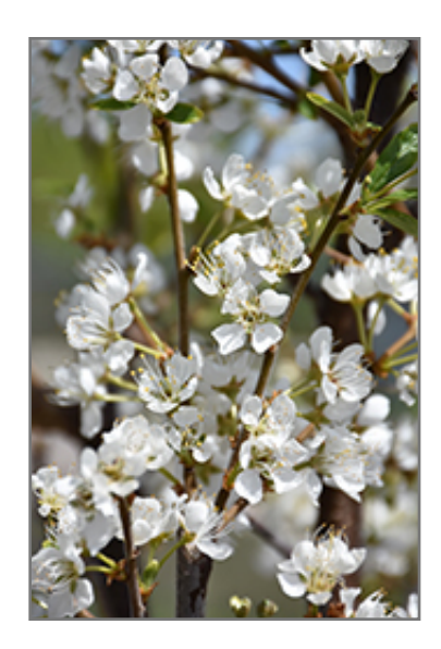
Toka Plum flowers