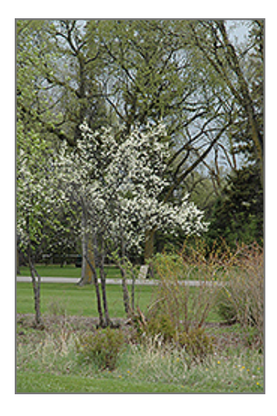
Toka Plum in bloom

This tree is typically grown in a designated area of the yard because of its mature size and spread. It should only be grown in full sunlight. It does best in average to evenly moist conditions, but will not tolerate standing water. It is not particular as to soil type or pH. It is highly tolerant of urban pollution and will even thrive in inner city environments. This particular variety is an interspecific hybrid.